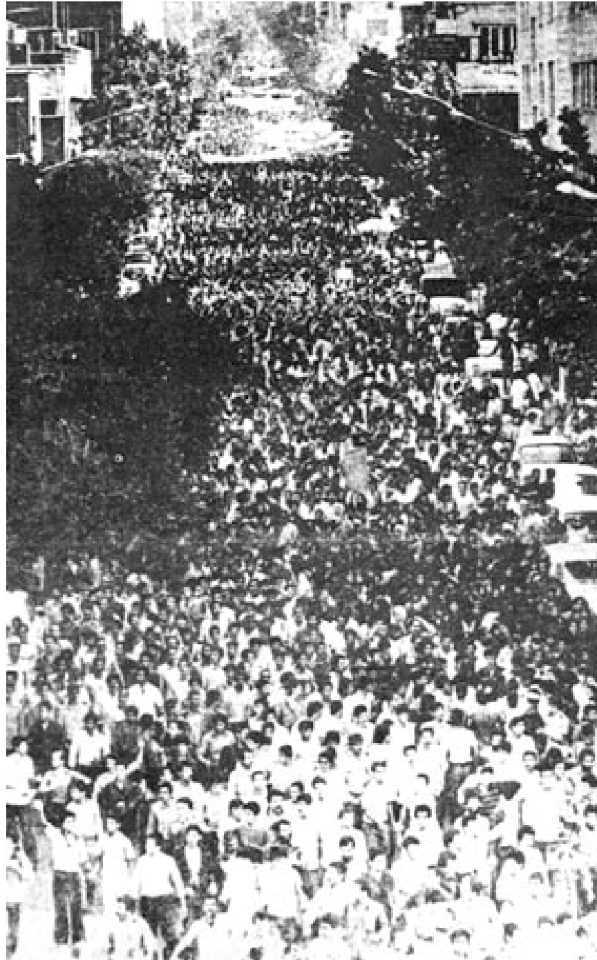
500,000 Mojahedin sympathizers demonstrate on June 20, 1981 in Tehran to protest the emerging dictatorship.